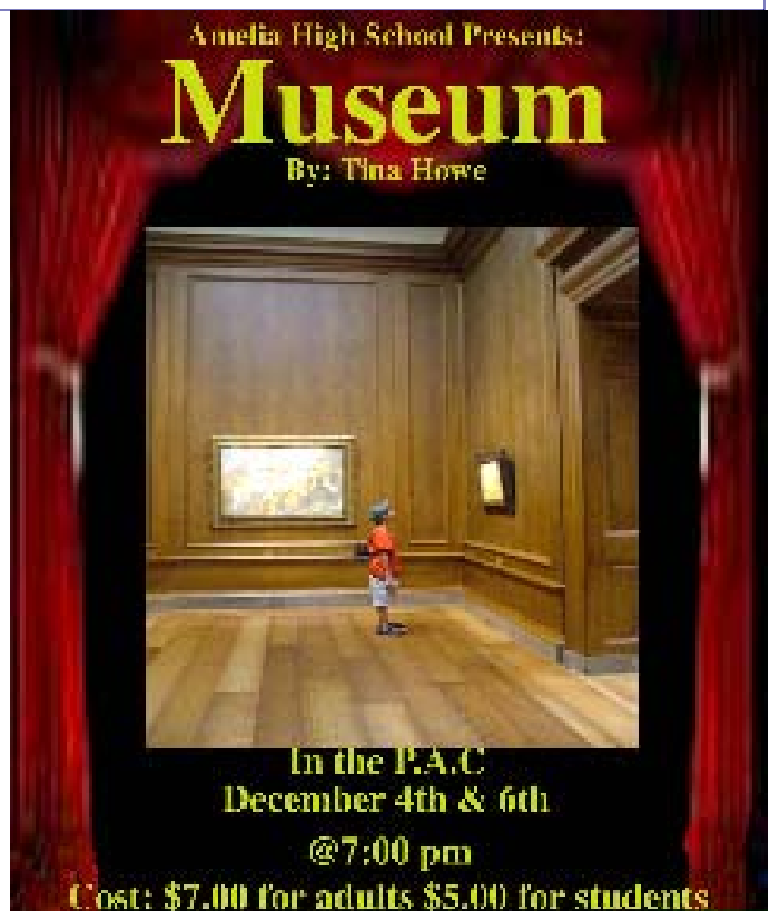
Poster design by Courtney Seibert